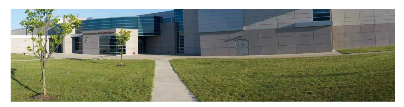
National Air and Space Intelligence Center headquarters at Wright Patterson Air Force Base.

It is unusual for an Air Force insider to come forward, as the Air Force <u>has been less forthcoming</u> than other agencies with regard to UAP. (https://thedebrief.org/why-is-the-air-force-